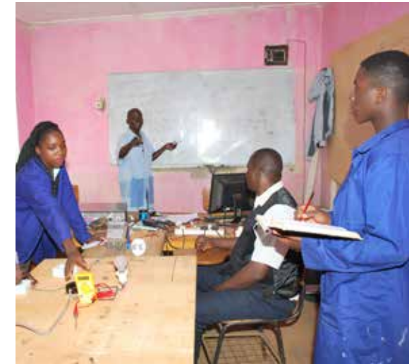
Students pursuing the Certificate in Electronic Engineering undertake specialised skills training in a lab at the School of Sciences