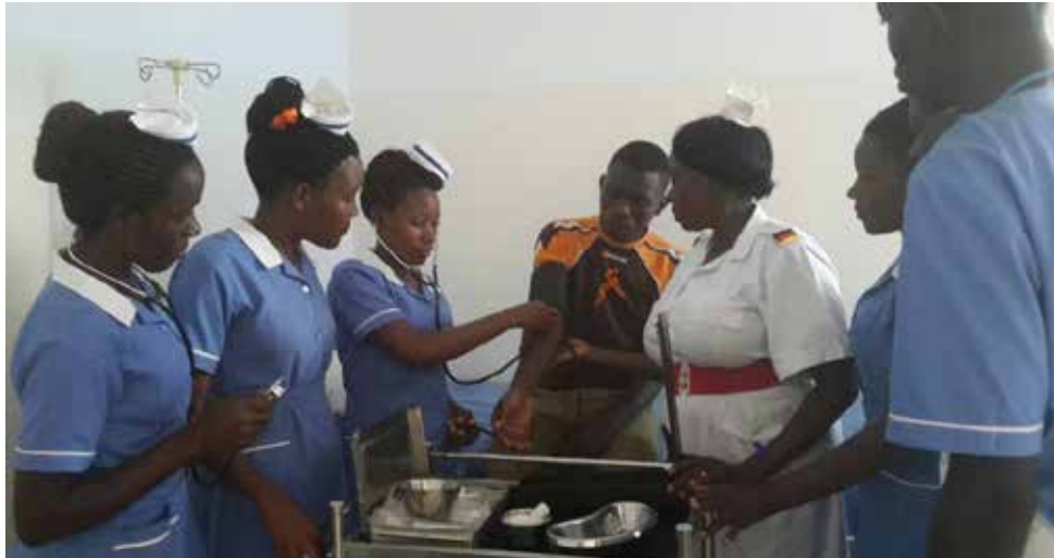
NKUMBA UNIVERSITY NURSING TRAINEES: A demonstration of the application of a stethoscope on a patient in a lab at the School of Sciences.

■ The first batch of nursing trainees commenced studies at the School of Sciences in November 2017. The nurse training started with the Diploma level, and with time the Degree level is to be introduced.